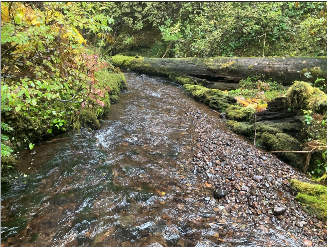
Figure 3.—Downstream view of channel at waypoint 923.