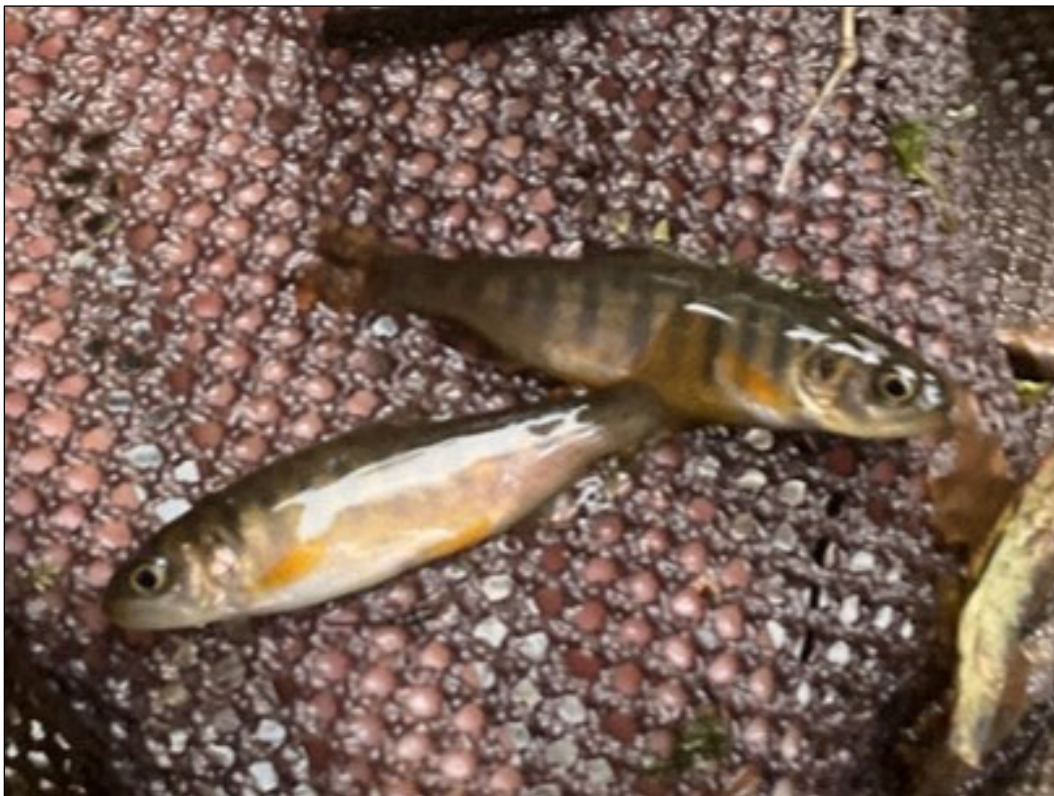
Figure 1.—Juvenile coho salmon captured at waypoint 923.