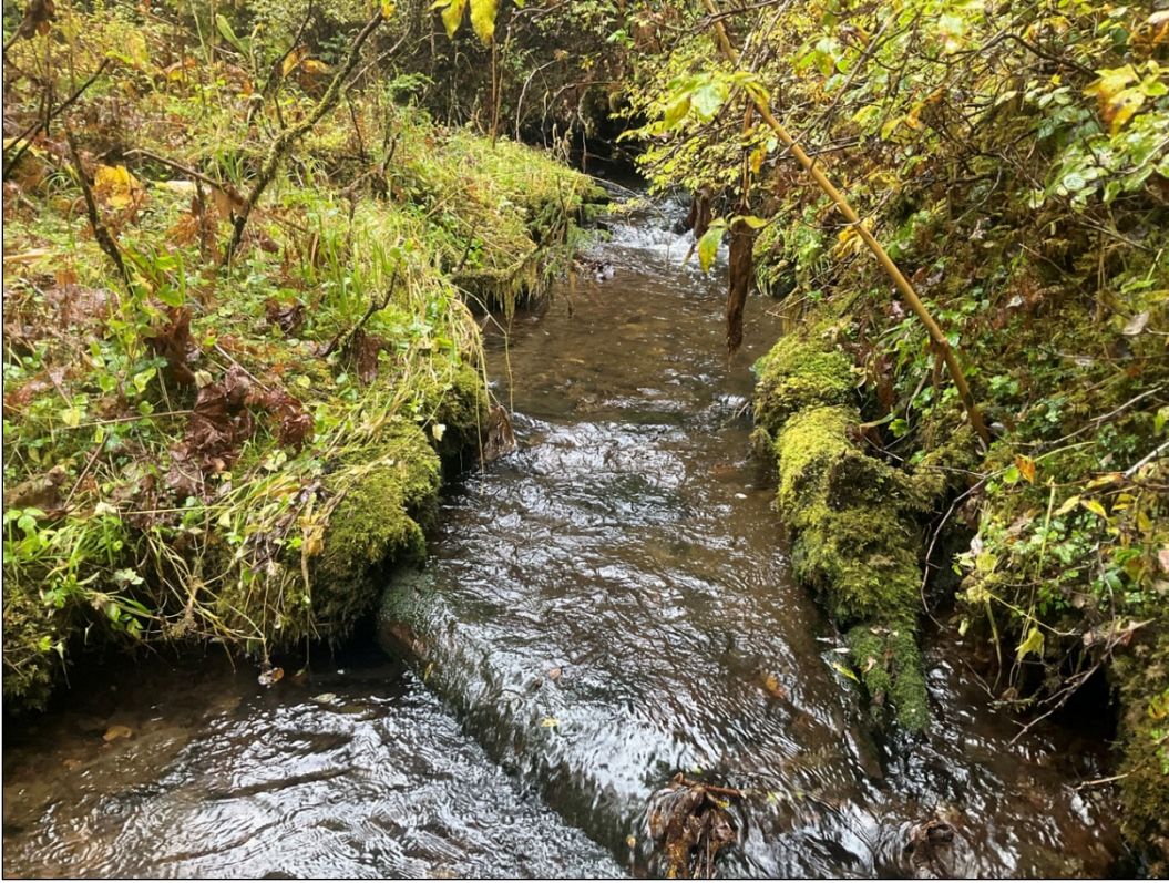
Figure 2.—Upstream view of channel at waypoint 923.